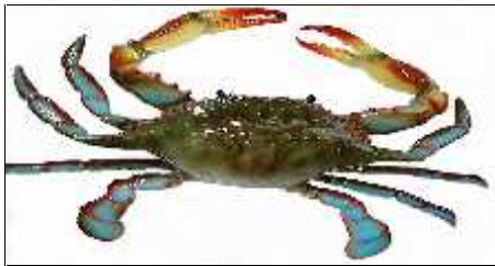
CR _ B _