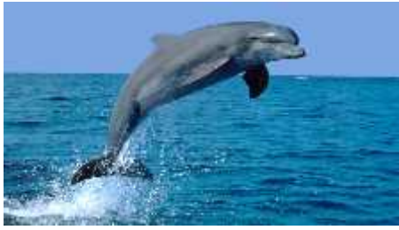
D _ L _ H _ N