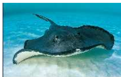
F _ Y F _ SH