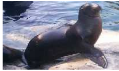
S _ A _