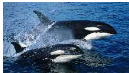
W _ AL _ S