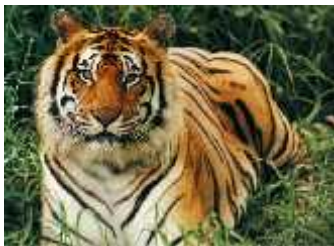
T _ G _ R