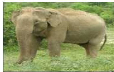
E _ E _ HA _ N _ _