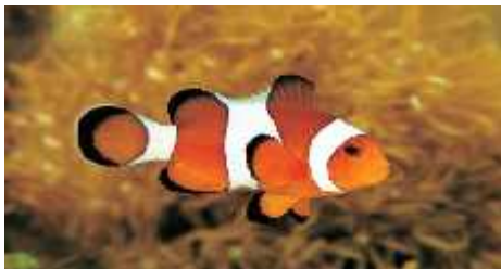
C _ WN _ I _ H