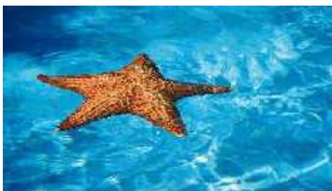
ST _ RF _ SH