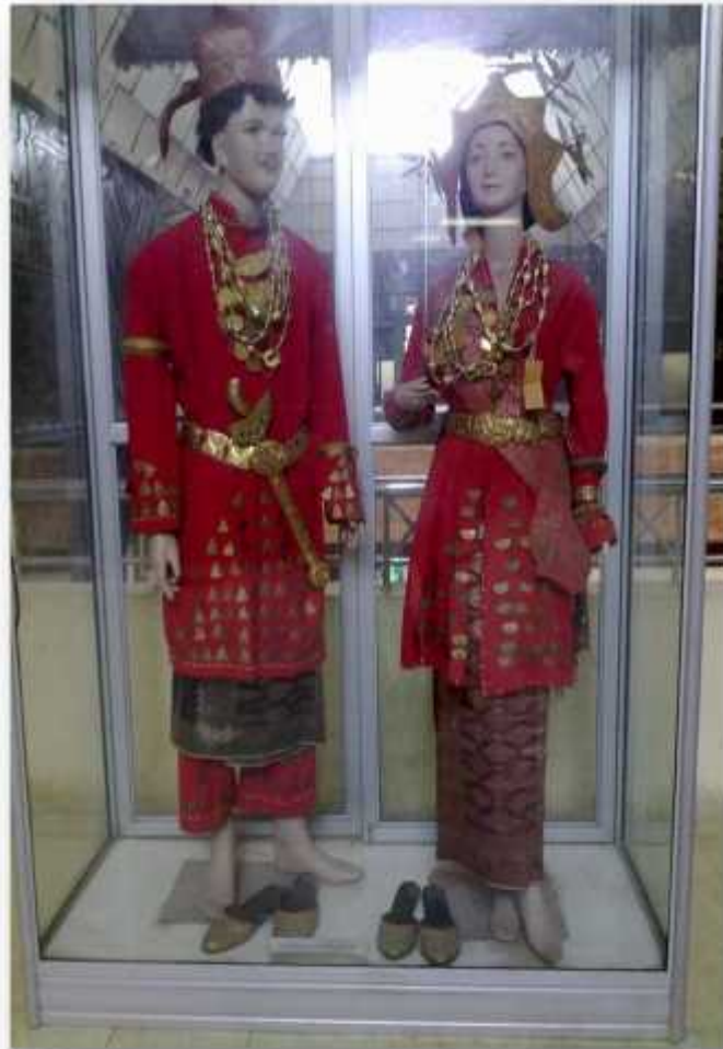
WEDDING CUSTOM OF LAMPUNG SAIBATIN