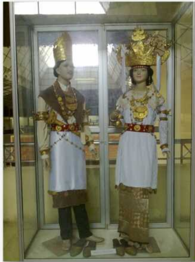
WEDDING CUSTOM OF LAMPUNG PEPADUN