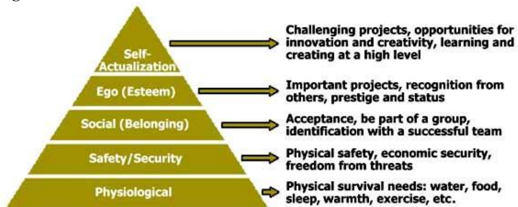
Figure 2.1. The Level of Motivation

Maslow's Hierarchy of Needs is shown above. The pyramid illustrates the five levels of human needs. The most basic are physiological and safety/security, shown at the base of the pyramid. As one moves to higher levels of the pyramid, the needs become more complex.